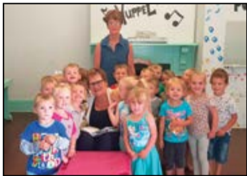
Op die foto van die kleuters by Kleuterkasteel.