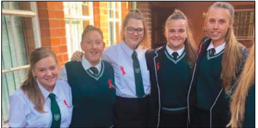
Op die foto bo leerlinge van Hoërskool Heilbron.