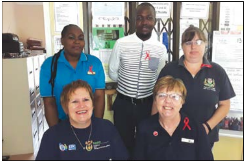
Op die foto bo van die personeel van Heilbron Kliniek.