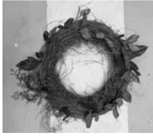
Stap 2: Bedek jou oase met mos. Gebruik die bloemistendraad om die mos mooi stewig vas te sit in die oase sodat dit nie kan verloor nie. Jy kan selfs die gongeweer gebruik indien daar stukkie is wat vasgeplak moet word aan die oase.