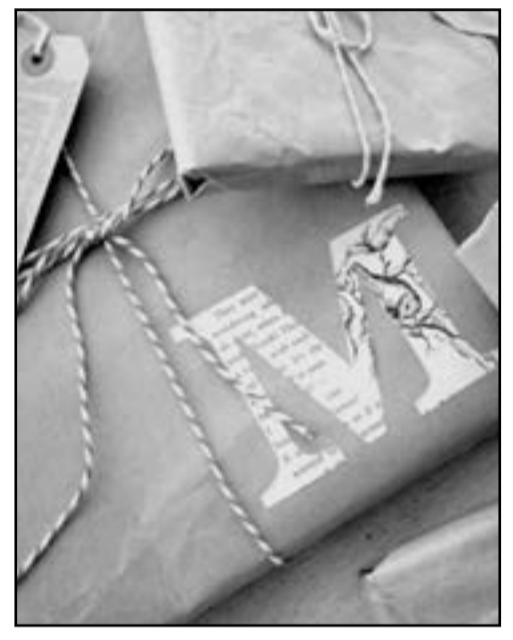
Bruinpapier kan weereens gebruik word om geskenke mee toe te draai. Knip die voorletters van 'n familielid of vriend uit ou koerante of boeke om die geskenk maklik tussen die ander uit te ken.