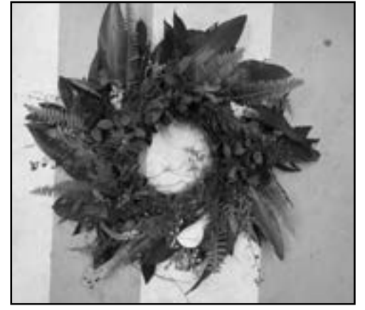
Stap 3: Gebruik nou jou blomme, blare en ander versierings. Gebruik verskillende teksture en groottes en druk dit op verskillende plekke in die oase in. As jy die krans klaar voltooi het, maak seker daar steek nêrens meer oase uit nie. Vir ekstra glans kan jy feestigies in jou krans gebruik.