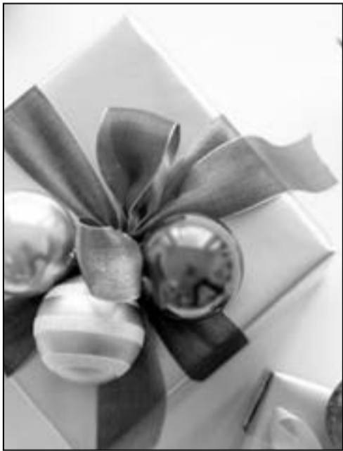
Gee jou kersgeskenk bietjie kleur deur ou kersballe te gebruik en met 'n groot strik saam te bind. Gebruik eenvoudige geskenkpapier om die balle te laat uitstaan.