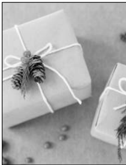
Versier jou kersgeskenke deur met doodgewone bruin papier toe te draai. Gebruik dennebolle, tou en groenheid om die geskenk mee af te rond.