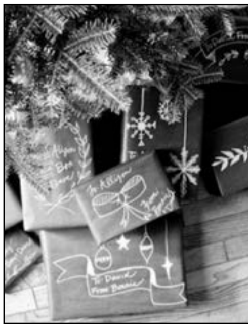
'n Oulike manier om jou kersgeskenke anders te laat lyk: draai die geskenke toe in swart geskenkpapier en gebruik 'n wit merke om die geskenk mee te versier.